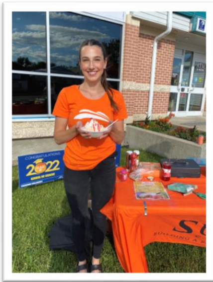
Holland staff served up ice cream ahead of the fireworks in their community on June 30.

In addition, the Reston branch continued its sponsorship and involvement with a Meat Draw through the Reston Golf Club. The draw is held twice monthly from May through September, with proceeds donated to local organizations.