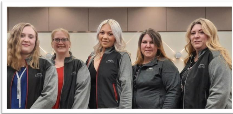
Virde staff volunteered their time at the Telus Cup Western Regional U18 Championship.

funded by government contributions, service groups, and corporate and individual donors. They provide rapid and specialized emergency care and transportation for critically ill and injured patients.