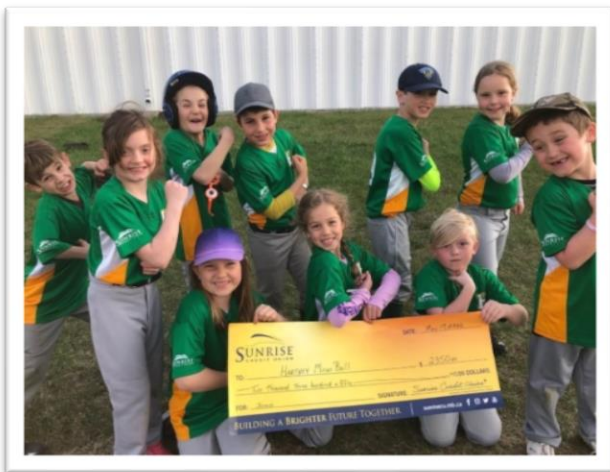
Hartney minor ball players show off the Sunrise logo on their new uniforms.

The inaugural Westman Flame of Hope Charity Golf Tournament was held June 10 at the Glen Lea Golf Course in Brandon, and Sunrise Credit Union was an Ace Sponsor ($3,000) for the event. The Tournament was in support of D-Camps and diabetes research.