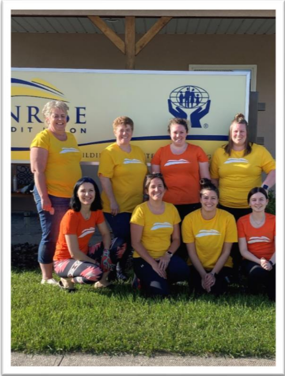
Baldur staff ready to go planting for the Baldur Flower Committee.

Updated statistics from Credit Union Central of Manitoba (CUCM) indicated that Sunrise Credit Union members continue to use e-Statements effectively to reduce the number of printed pages. The statement cycle in April showed that approximately 52.7% of business members and about 65.5% of personal members use e-Statements rather than having mailed printed statements. Overall, each month, 33,000 pieces of paper are no longer printed by offering the e-statement option.